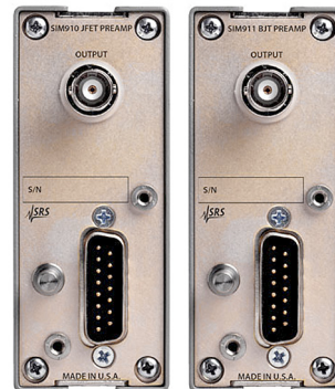
SIM910 & SIM911 rear panels